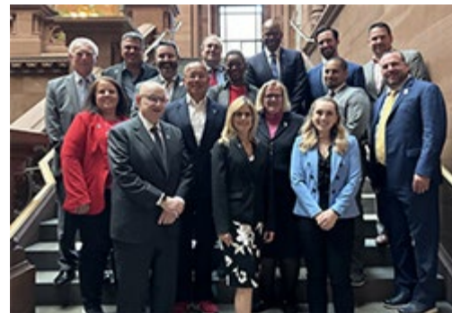
The NYSSCPA Lobby Day Delegation on the Million Dollar Staircase inside the New York State Capitol Building