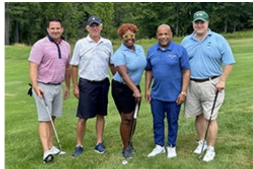
The NYSSCPA Team with Assembly Speaker Carl E. Heastie (D-Bronx)